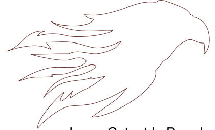
Laser Cutout In Barrel