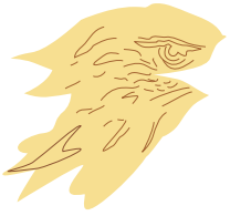
Laser Cut Head Inlay