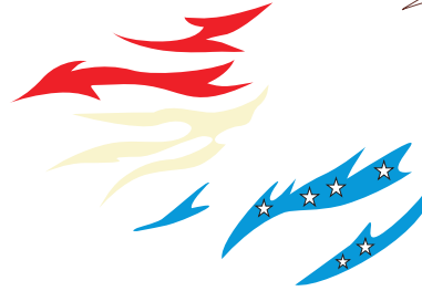
Six Laser Cut Feather Inlays